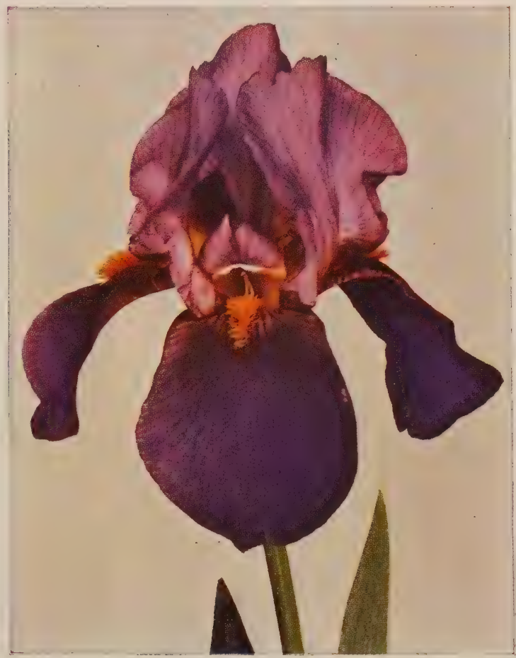
Claret Velvet—$1.00 (Page 7)